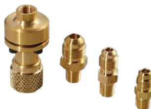
VPAS8 ANTI-SIPHON VALVE KIT 3/8" SAE female knurl nut