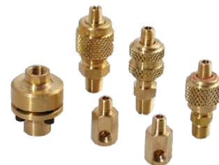
VPASU ANTI-SIPHON VALVE KIT 1/4" SAE, 3/8" SAE, 1/2"-20 UNF female knurl nut