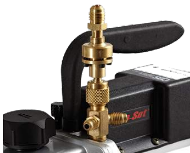
VPAS4 ANTI-SIPHON VALVE KIT 1/4" SAE female knurl nut